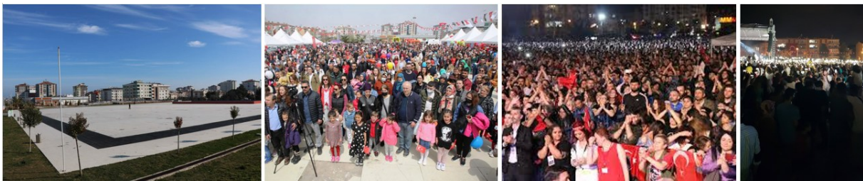
Figure 3a. Square status of the area (2019).

The area, which was configured as a square in 2019, functioned as a representational public space characterized by extensive hard surfaces and ceremonial zones, offering an open space for citizens. However, following the transformation in 2024, a significant portion of these hard surfaces was removed and replaced with green spaces, seating areas, walking paths, and children’s playgrounds.