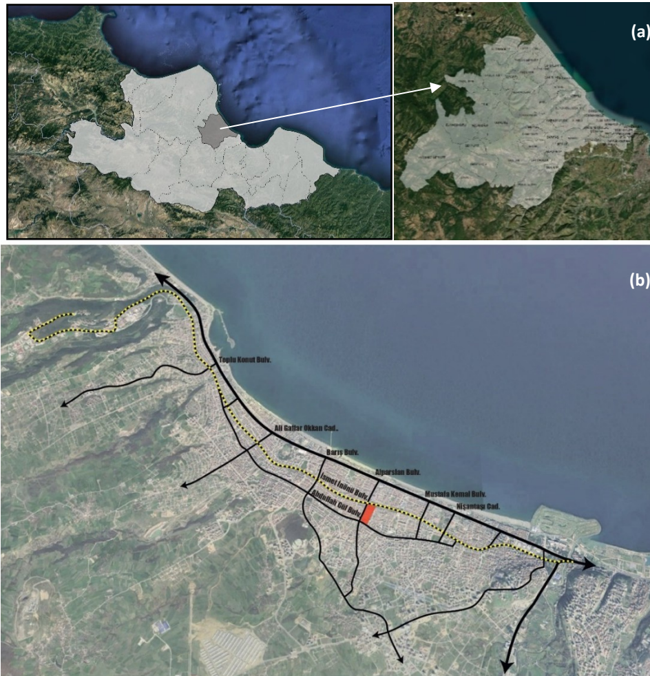
Figure 1a. Location of Atakum District and Its Neighborhood Boundaries.

Atakum City Square was designed and constructed by Atakum Municipality between 2018 and 2019 and subsequently opened for public use. Covering a total area of 9,472 m 2 , it is located within the boundaries of Mimar Sinan Neighborhood, at the intersection of Abdullah Gül Boulevard and Alparslan Boulevard. The surrounding area includes educational institutions, commercial zones, socio-cultural facilities, ground-floor retail units within residential buildings, and other park areas (Figure 1a–b).