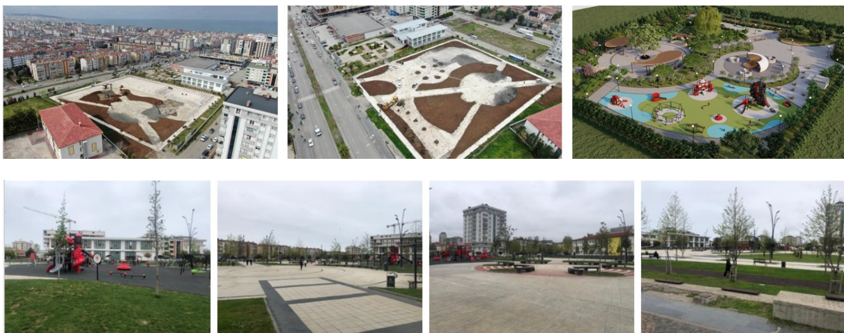
Figure 3b. Parking status of the area (2024-2025).

The physical appearance of the area in 2019 and 2025 has been documented through a comparative photographic analysis. These visuals (Figures 3a–b) clearly illustrate the shift in the intended use of the space. While the area functioned primarily as a venue for ceremonies and temporary events during its designation as a square, its identity as a park has prioritized individual and everyday uses.